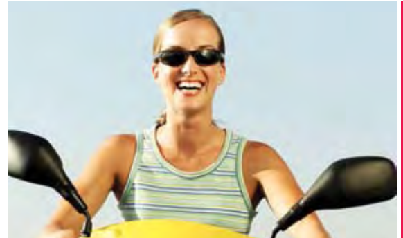
Fast transactions. Intelligent Deposit. Happy Customers.

When other banks are still using the time-consuming "one-check-at-a-time" process, you can install our bulk check intelligent deposit solution to give your merchant customers maximum convenience. Save time for all your depositors and gain more commercial and retail customers.