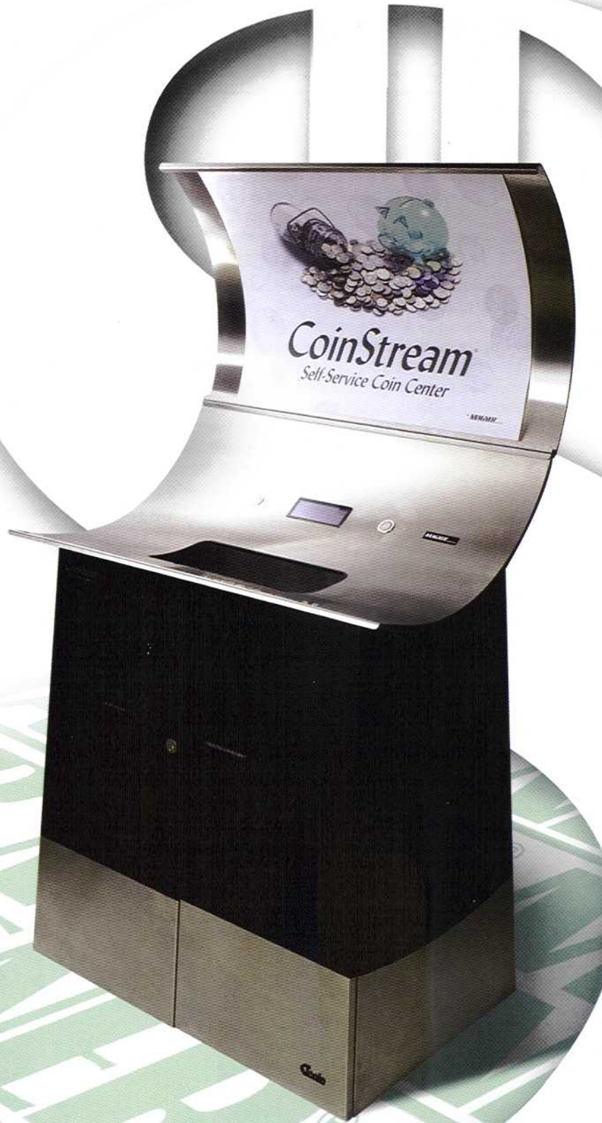
CoinStream® CDS 709 with optional sign