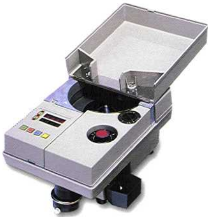
Magner Model 920

Customers worldwide are assured of ongoing support for all Magner products through our network of Authorized Distributors and our Direct Technical Support Team (TST).