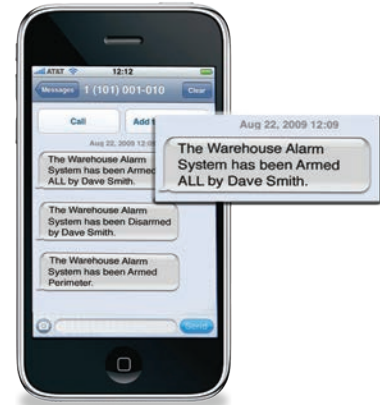
Use any model of cell phone for MyAccess Messaging