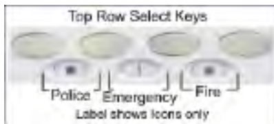
Panic Key Labels

The top row of keys can be used as 2-button panic keys. The user simply presses and holds two of the keys simultaneously to send either a panic, non-medical emergency, or fire report to the Central Station.