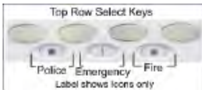
Panic Key Labels

The top row of keys can be used as 2-button panic keys. The user simply presses and holds two of the keys simultaneously to send either a panic, non-medical emergency, or fire report to the Central Station.