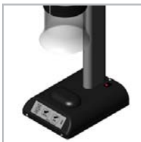
ComCo's Model STC 4500 Single-Sided 4 1/2" Chute