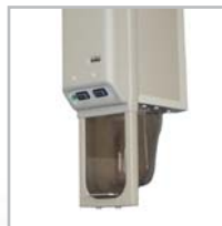
ComCo's manual or automatic 521 4 1/2" Operator Unit