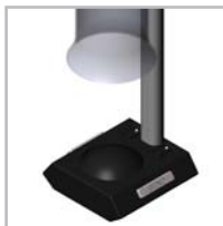
ComCo's Model DSC 1000 Dual-Sided 4 1/2" Chute