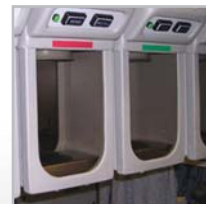
ComCo's 521" dual-side 4 1/2" Operator Unit