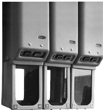
Model 521 Dual-Side Teller Units