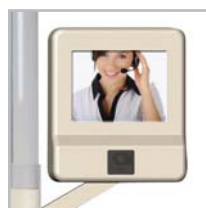
CVM 1000 Optional Customer Video Module with high contrast 10" color LCD Monitor