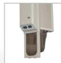
Model 521 Motorized Operator Unit