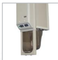
Model 521 Manual Operator Unit