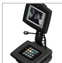
CCS-1561 Optional Audio/Video Station for 1 to 16 lanes provides exceptionally clear audio and video and with a high contrast 6.4" color LCD Monitor