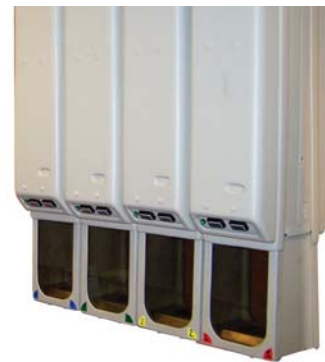
Model 521 Dual-Side Operator Units